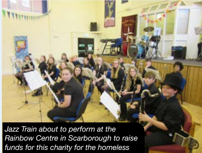
Jazz Train about to perform at the Rainbow Centre in Scarborough to raise funds for this charity for the homeless

Our Open Morning on 18 May (and Open evening on 21 May) saw quite a few visitors through our doors from the parents of existing students to parents of those wishing to join. Refreshments were served and parents got the opportunity to talk with the Musical Directors.