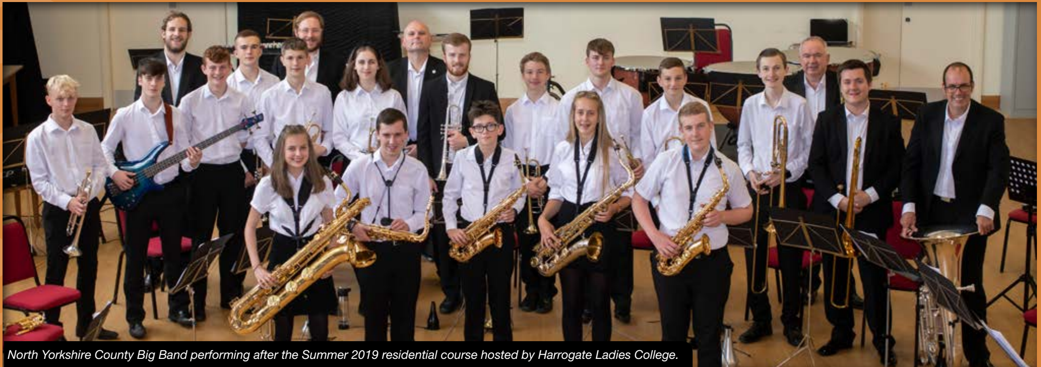
North Yorkshire County Big Band performing after the Summer 2019 residential course hosted by Harrogate Ladies College.

How to sign up for your FREE Active Music Subscription