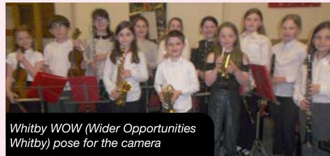
Whitby WOW (Wider Opportunities Whitby) pose for the camera

Our year culminated in our big Summer Concert at the Whitby Spa on 4 July which involved the entire Music Centre. Every year this concert has a theme and this year it was 'Dance'. We were lucky to be joined on this occasion by the St Hilda's Dance Academy. Students from the Academy carefully choreographed dances to accompany and enhance the pieces played by the ensembles. This was a first for the centre but we hope to work with them again in the future as it was extremely popular with the audience and students alike.