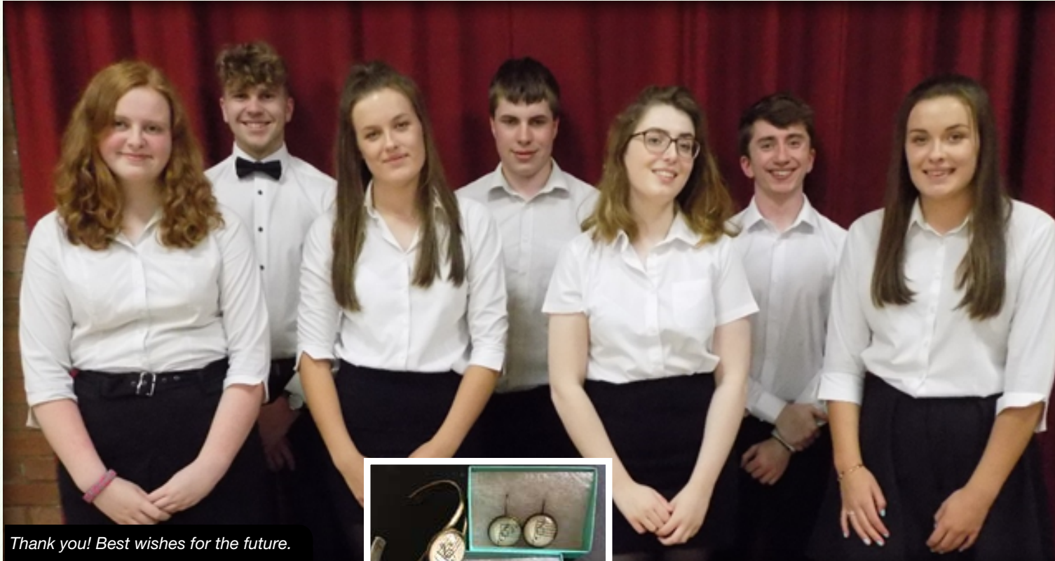
Thank you! Best wishes for the future.