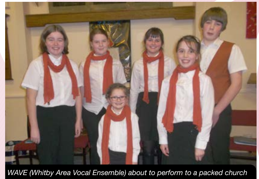
WAVE (Whitby Area Vocal Ensemble) about to perform to a packed church