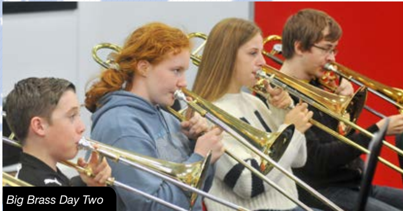
Big Brass Day Two