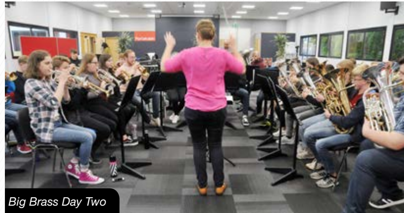
Big Brass Day Two