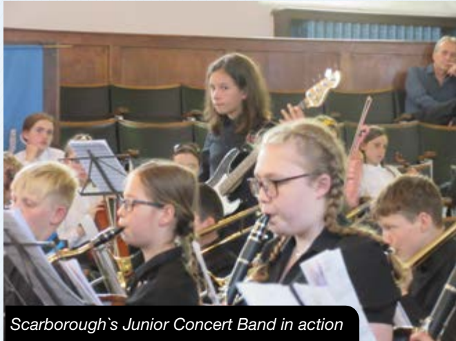
Scarborough's Junior Concert Band in action