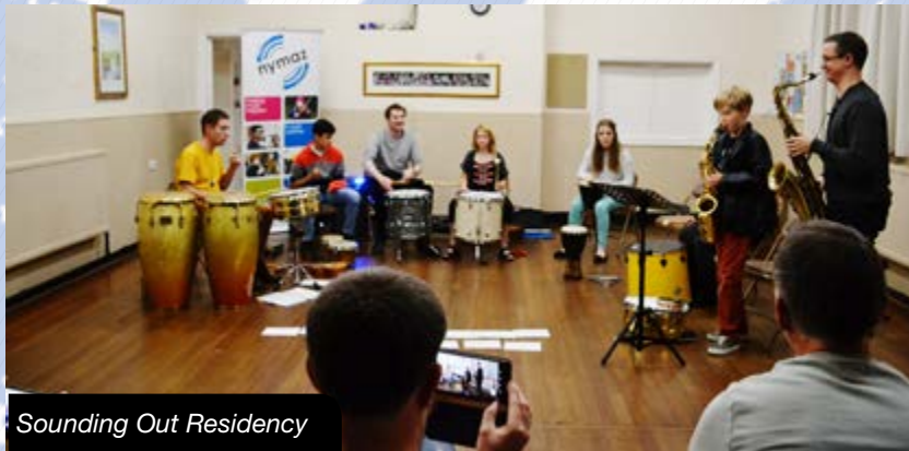
Sounding Out Residency