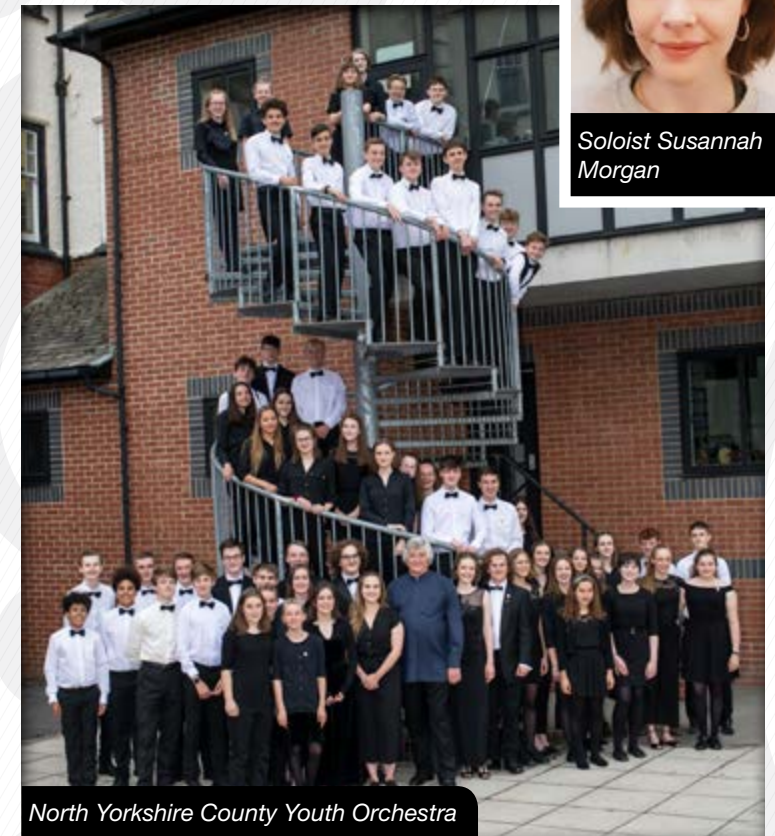
North Yorkshire County Youth Orchestra