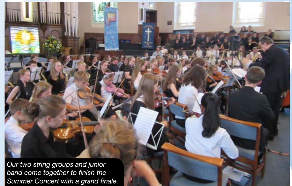
Our two string groups and junior band come together to finish the Summer Concert with a grand finale.

On 6 July we took our smaller ensembles to Sinnington Methodist Chapel to perform. There were also soloists who had volunteered to perform too, and even a ventriloquism double act! We were also joined by 'Moorland Wind' an adult locally based wind ensemble and friends of the Music Centre.