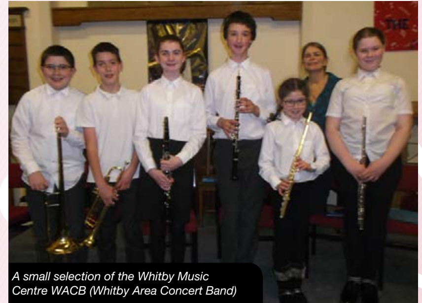
A small selection of the Whitby Music Centre WACB (Whitby Area Concert Band)