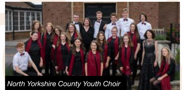
North Yorkshire County Youth Choir

Other songs performed in the concert included 'Shallow' from 'A Star is Born', 'Ombra Mai Fu' by Handel, a Mamma Mia medley and 'Bohemian Rhapsody'. Quite a few members of the choir sang short solos in several of the pieces and it was great to see everyone's confidence increase during the week, leading to some lovely solos on the night. Well done to all the choir members for working so hard all week – we all had a brilliant time and we look forward to meeting again in the Autumn term. New members are always welcome!