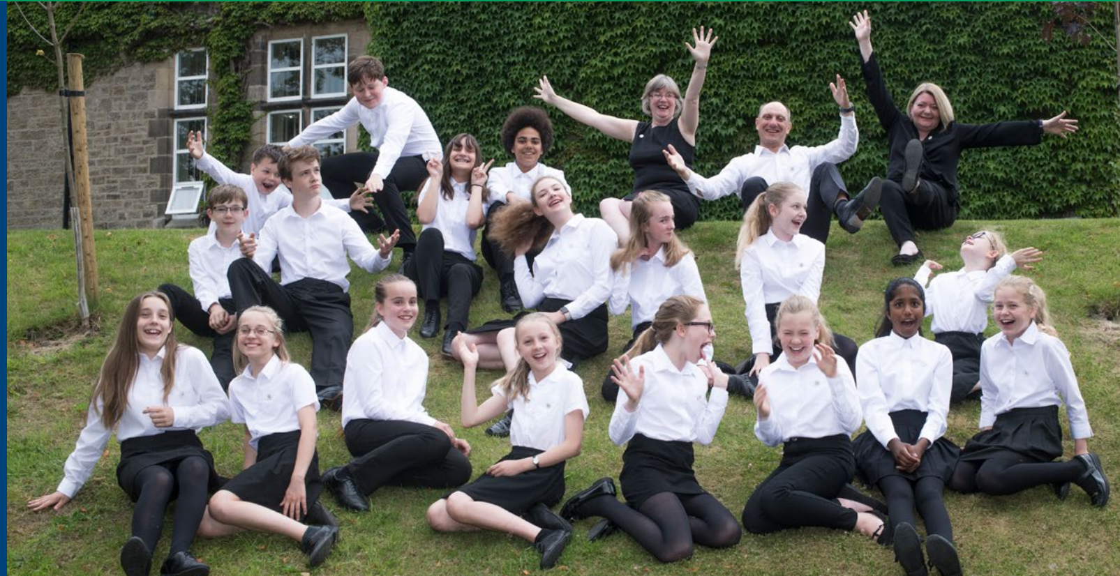
Pictured above: County Concert Orchestra 2018

There are great opportunities to be part of the Hub and this edition contains information about how and when you can get involved in music making across the county.